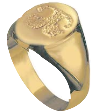
14k yellow gold, Signet Ring with noseprint 3/8"W x 8/16"L Shown with normal top in sizes from 3.5 - 8.5

With classic style, Meadow Hill's Signet Rings hold the print of your beloved pet. These rings are available in 14k white or yellow gold, in sizes 3.5 to 13.5.