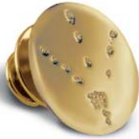
14k yellow gold, Grand, lapel pin