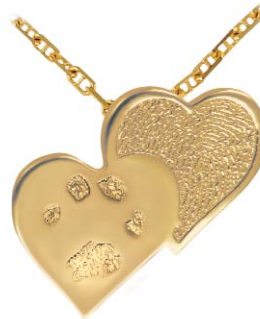
14k yellow gold, double Heartfelt charm with a fingerprint and a pawprint

You and your buddy... Put your hearts together on one piece with the double Heartfelt charm. Place your pet's noseprint on top of your own full fingerprint.