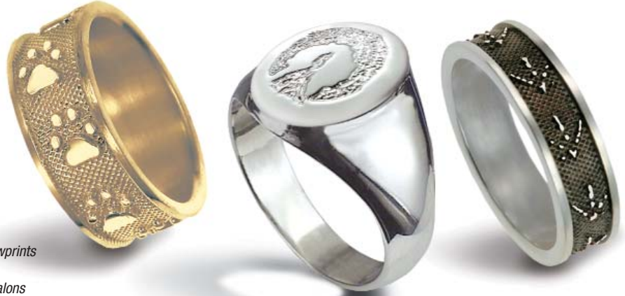
14k yellow gold, 8mm Remembrance Band with pawprints 14k white gold, Signet Ring with hoofprint sterling silver, 6mm Remembrance Band with bird talons

With a twist of this special ring, the mind paints vivid pictures of your beloved pet. Especially, when the ring bears the unique touch of your pets' paws or cold, wet nose.