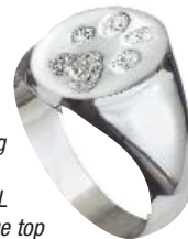
14k white gold, Signet Ring with pawprint 7/16"W x 9/16"L Shown with large top in sizes from 9 - 13.5