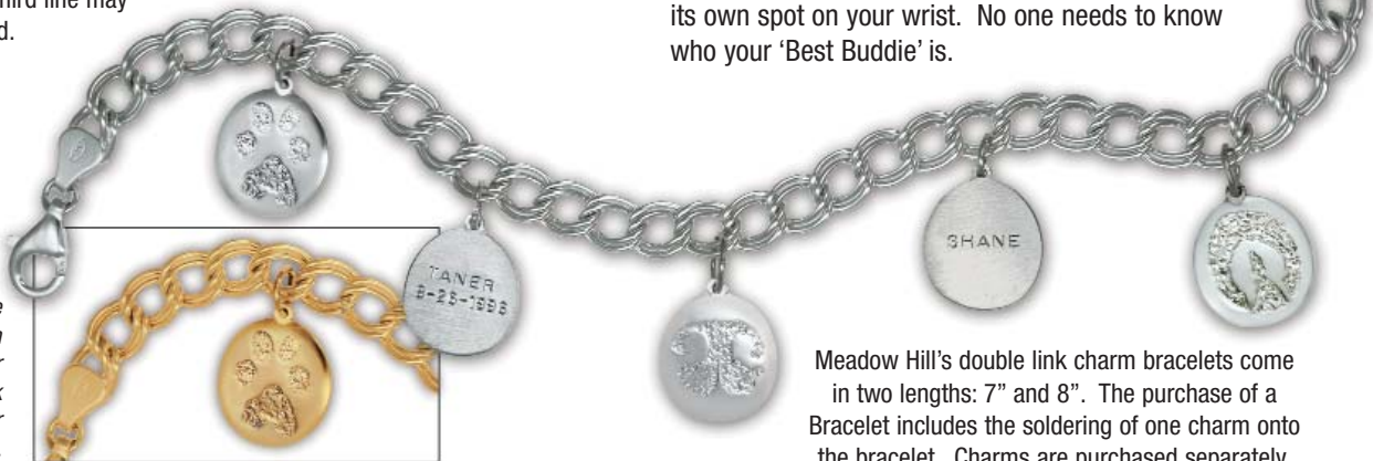
Bracelets are available in sterling silver and 14k yellow or white gold.

An optional third line may be purchased.