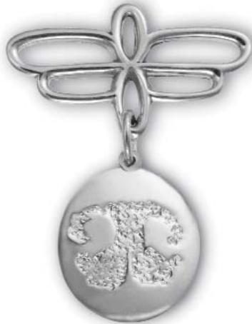
14k white gold, Hanging Charm Pin, with noseprint

A woman's jewelry holds layers of meaning. Beyond the obvious decorative value, her favorite pieces often speak of connections with things that bring routine to her busy life, like the imprint of the dog's nose on the patio sliding door. How many times has she washed it off this week?