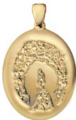
14k yellow gold, Grand, hoofprint charm