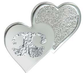
Sterling silver, double Heartfelt charm with a fingerprint and a noseprint

You and your buddy... Put your hearts together on one piece with the double Heartfelt charm. Place your pet's noseprint on top of your own full fingerprint.