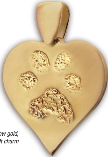
14k yellow gold, Heartfelt charm

Meadow Hill's Heartfelt Charms reflect the touch of unconditional love offered by our best Buddies.