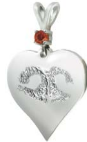
Sterling silver, Heartfelt print charm with January birthstone