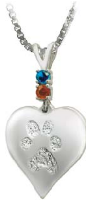
Sterling silver, Heartfelt print charm with September and January birthstones and chain

Add a birthstone or diamond to your Heartfelt keepsake charm to make it even more endearing.