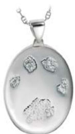
14k white gold, Grand, pawprint charm with chain

All of the options available for Standard Buddies Charms are offered on a Grand Charm.