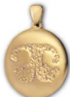
14k yellow gold