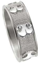
14k white gold, Remembrance Band with repeating noseprints Shown in 6mm

Multiple pawprints, noseprints or other prints are placed in a channel created by polished raised edges. Prints may be from the same or multiple animals. Available in 6mm (1/4") and 8mm (3/8") widths, in sizes from 3.5 to 13.5. Various layouts for pawprints and noseprints are shown.