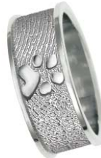
Sterling Silver 8mm Remembrance Band with full fingerprint and pawprint overlay