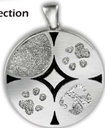
A Family of Four in 14k white gold

Our pets quickly become members of the family. These exciting, multi-print charms remind us of the strong bonds we have with our animal friends.