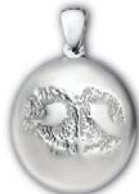
14k white gold