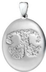
Sterling silver, Grand, noseprint charm